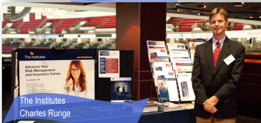
The Institutes Charles Runge