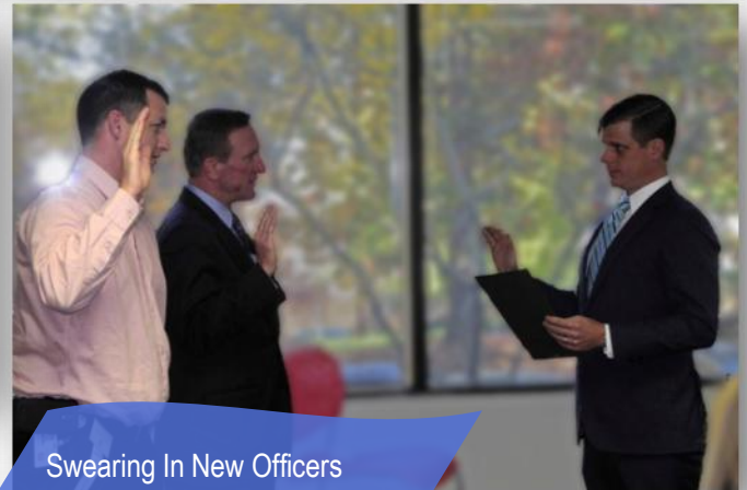
Swearing In New Officers