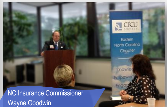
NC Insurance Commissioner Wayne Goodwin